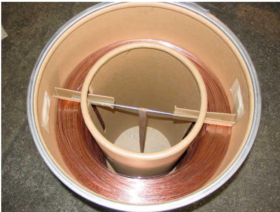
Drum Packing: 350kg/Drum, Drum Size:660*810mm(Height)